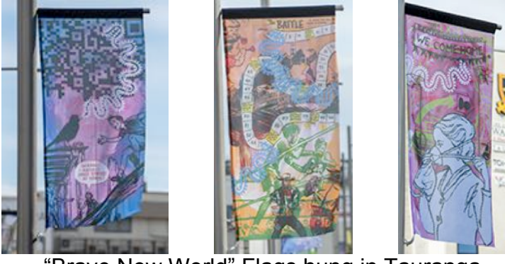
"Brave New World" Flags hung in Tauranga

The original works for the flags are screen print and collage. The flags are commercially digitally printed by Auckland Flagz.