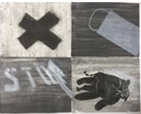
Detail from Walking Notes (2020) by Celia Walker. Monoprint, stencil.

A subsequent set of larger prints, Walking Notes (2020) grew from this original series, this time depicting some of the waste materials generated by the pandemic which have become powerful symbols of our time; a discarded mask, a crumpled glove. Placed alongside each other, the prints create an overall effect of paving stones, containing visual cues of social distancing: stop signs, arrows and black crosses guiding us through danger in an attempt to protect the public from the spread of the pandemic. Yet, it also raises the question - in protecting ourselves, are we doing so at the expense of our natural environment?