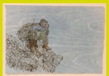
Glassing Down by Meg Wilson

The original works for the flags are screen print and collage. The flags are commercially digitally printed by Auckland Flagz.