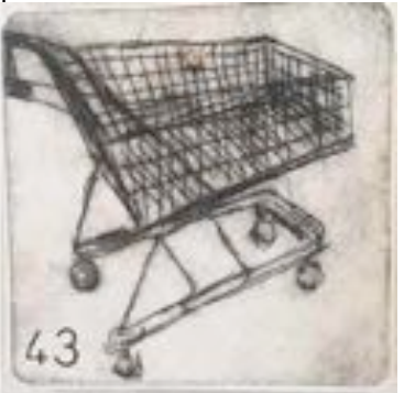
Detail from Lockdown Prints (2020) by Celia Walker. Drypoint.

Walker then composed tiny black and white prints, numbering each one to mark the passing days. Together Lockdown Prints (2020) bring to mind a collection of polaroids, a snap shot of forgotten corners, evoking a quiet, sombre atmosphere.