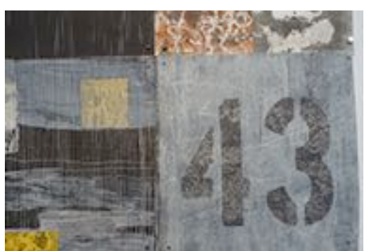
Left & right: Details from Random Surfaces (2020) by Celia Walker. Monoprint, collograph, stencil, collage.

Visually, these prints employ her signature style of heavily textured and tonal works, layering several plates to build up a complex surface texture using a combination of monoprint, collagraph, stencil and drypoint techniques.