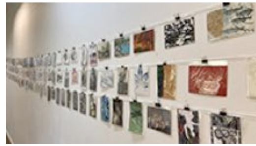
Art at Wharekupe; Postcards from the North and South

Further north, Art at Wharepuke, Kerikeri, presents the exhibition Postcards from the North & South, Nov 16 - Dec 12.