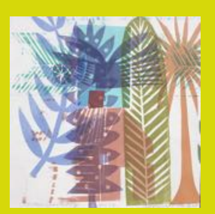
'Urban Sanctuary' - Basia Smolnicki