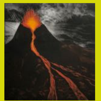
'Eruption' - Nan Mulder