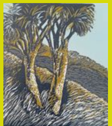
'Coastal Watch' - Bev Pawluk