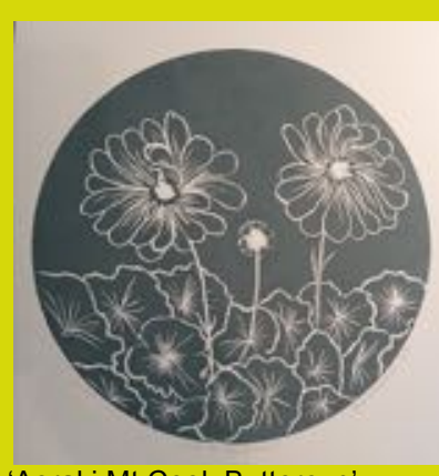
'Aoraki Mt Cook Buttercup'