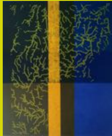
'River Series No 2' – Suzy Costello