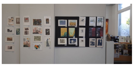
PCANZ Small Print at Art Vault 2021