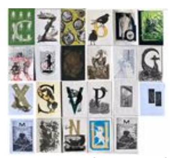
Bestiary - 22 0f 26 letters of the Alphabet

The Bestiary book is approaching the finishing line with all participants having handed in their editions and those who are running close to the finishing line have let me know where they are at with their printing. All is going according to plan and we should have the books, required by PCANZ made by the middle of September. We will run a bookbinding workshop later in the year for those who participated.